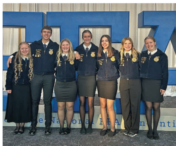
Benjamin Logan FFA members gather for a picture at the National FFA Convention in Indianapolis.

The final day of the trip was dedicated to community service as part of the National Day of Service. Members worked together to give back to the community. After completing their service project, students enjoyed hot chocolate and snacks as they