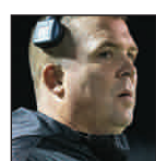
IL head coach