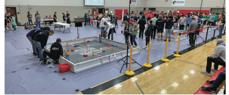
BCS Robotics hosts "King of the Hill" at Bellefontaine Middle School Saturday.

9185F "Pickle Bots" went 4-2 in the qualifiers, picking their sister team 9185N "Gemini" (3-3) going all the way to the semi-