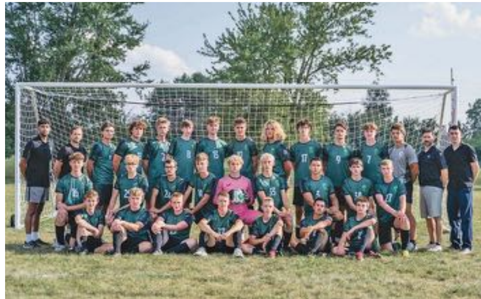
MEMBERS OF THE CALVARY CHRISTIAN BOYS SOCCER TEAM

He said that the keys for success are staying committed, encouraging each other and playing with purpose. “If we honor God with our effort, attitude, and actions, that will create a successful season.”