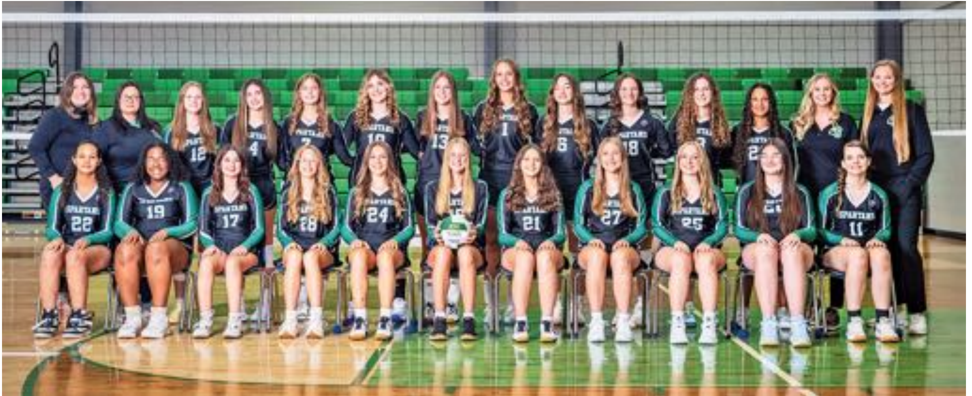
MEMBERS OF THE 2025 CALVARY CHRISTIAN VOLLEYBALL TEAM

*NOTE: As of press time we had not obtained the names from the school.