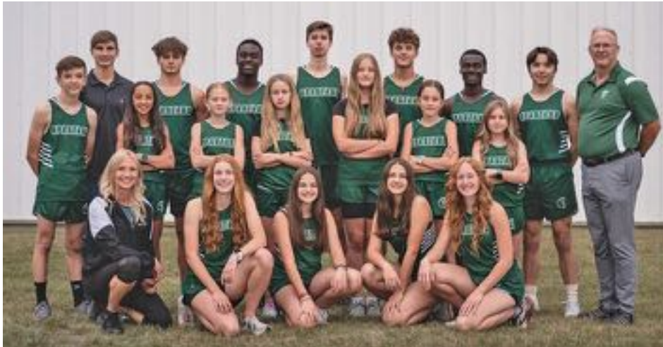
MEMBERS OF THE CALVARY CHRISTIAN CROSS COUNTRY TEAM *NOTE: As of press time we had not obtained the names from the school.