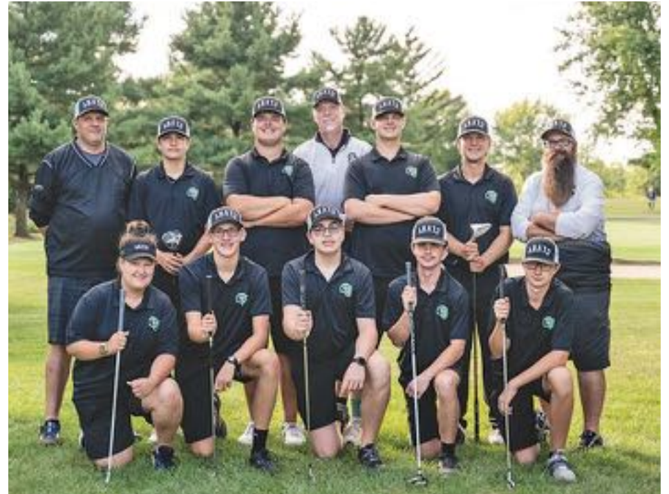
MEMBERS OF THE 2025 CALVARY CHRISTIAN GOLF TEAM *NOTE: As of press time we had not obtained the names from the school.

He cited Emmanuel Christian, Legacy Christian and Yellow Springs as the programs that will serve as the main competition for the Spartans.