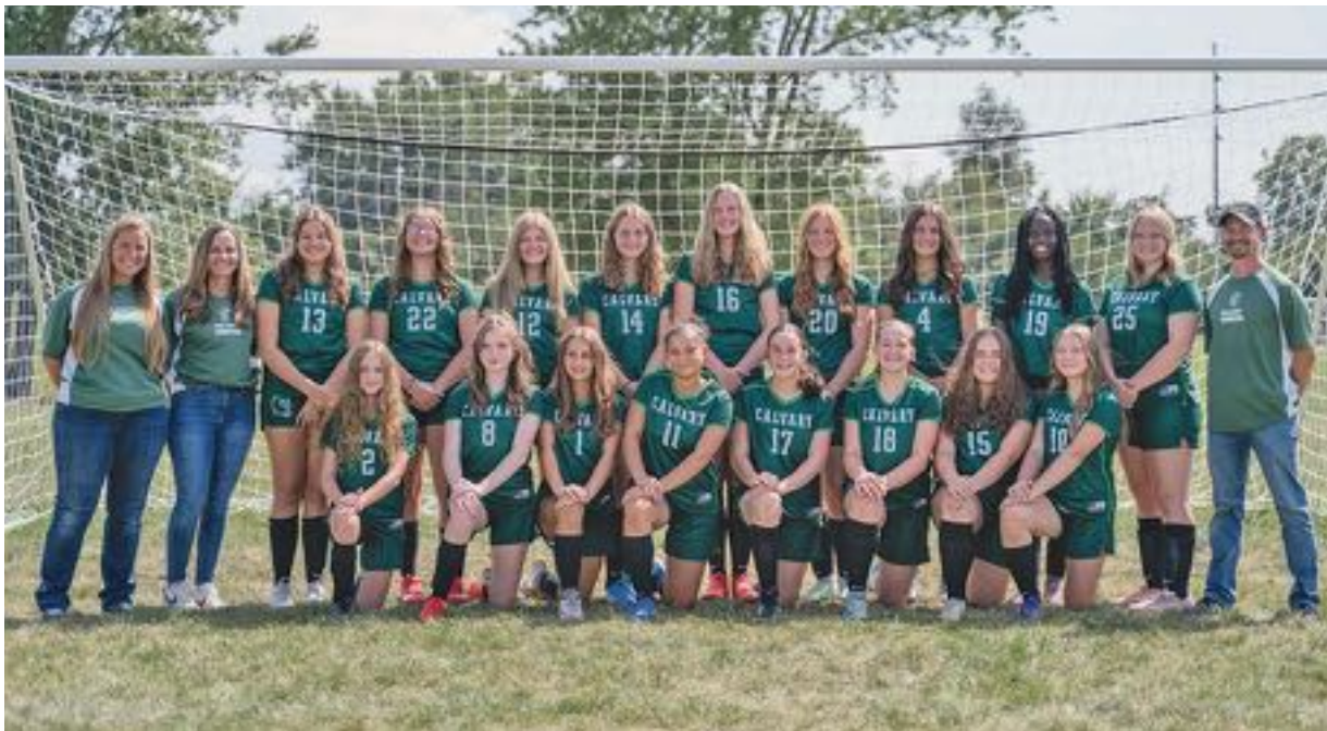
MEMBERS OF THE CALVARY CHRISTIAN GIRLS SOCCER TEAM *NOTE: As of press time we had not obtained the names of the players from the school.