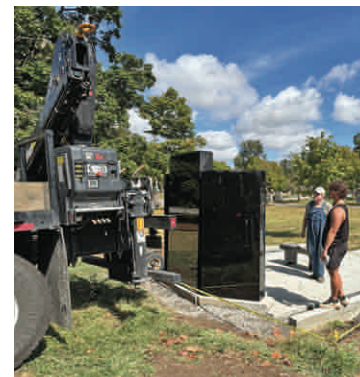
The new Veteran Monument is hoisted into place Tuesday afternoon, while supporters watch the process.

Pavers surrounding the site name each of the 13 conflicts, along with a paver honoring Sept. 11 and one recognizing 22 A Day (Military Suicide Awareness). A bench has been installed at the center to allow for a moment to pause and reflect on the courageous sacrifices.