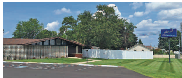
Adriel celebrates the opening of its new Bellefontaine location with an Open House and Ribbon Cutting on Thursday, Oct. 9, at 1600 S. Main St., Bellefontaine.

to connect with community members, Adriel staff and board leadership. Founded in 1896, Adriel remains steadfast in its mission to provide quality care to children, young adults and families in the spirit of Christian love. Through foster care, family preservation, clinical services and supportive programs, Adriel serves some of Ohio's most vulnerable children and youths — ensuring safety, stability and hope. "We are thrilled to open our new doors and