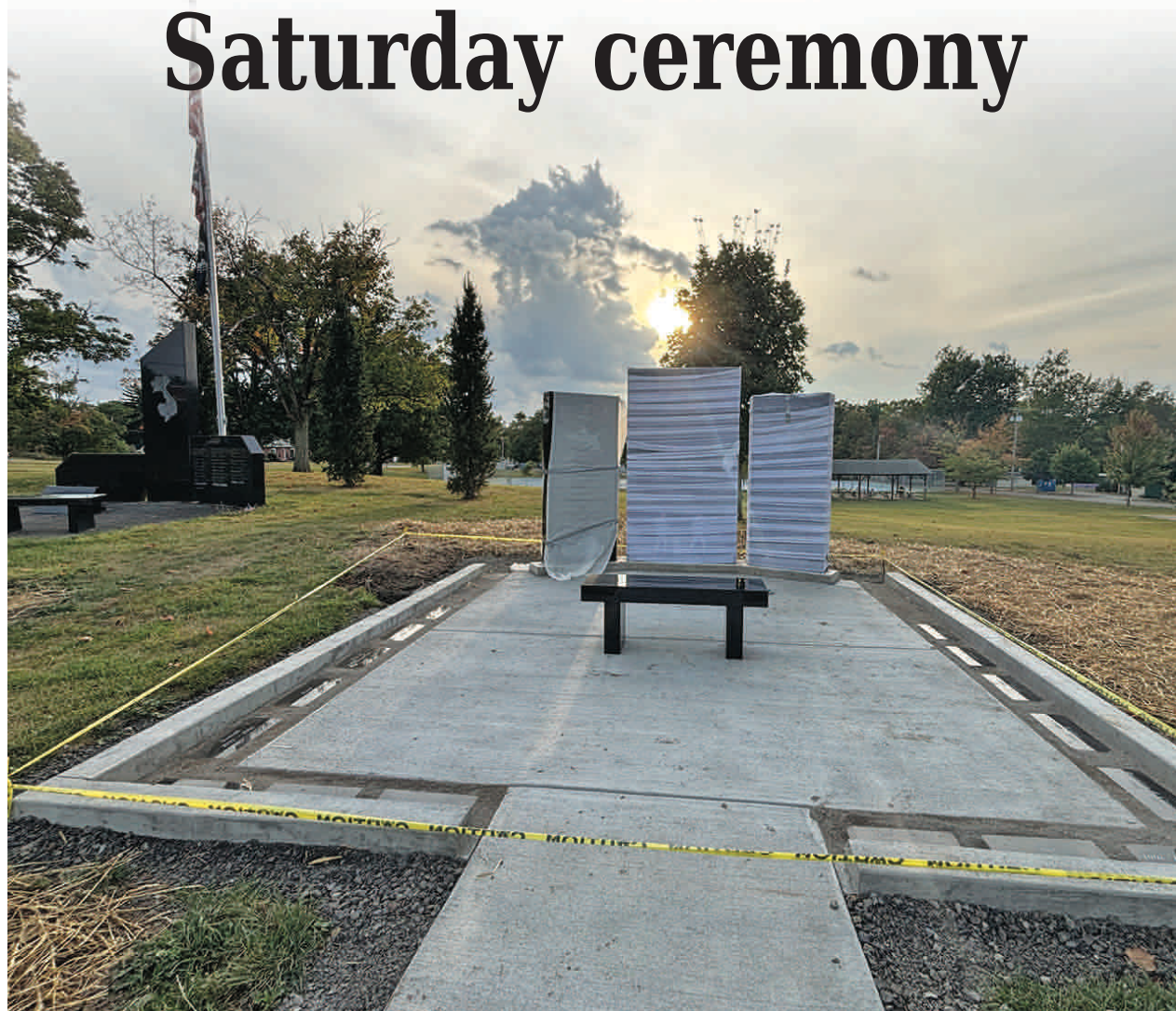
The new Veteran Monument site at Mary Rutan Park along Allison Road is covered for the time being, until it's unveiled at the dedication ceremony Saturday morning.