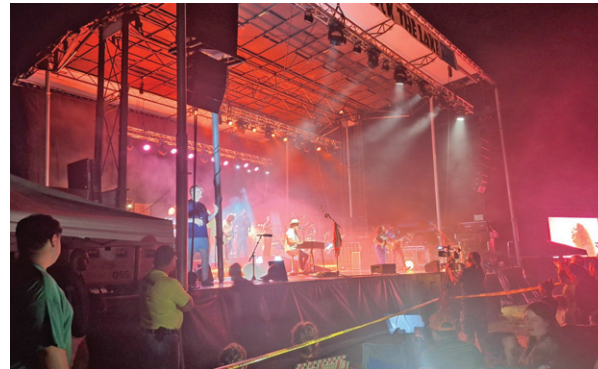
Headliner We the Kingdom brought the 2025 Rock the Lake music festival to a close on Saturday, Aug. 2, performing hits like "Child of Love" and "Holy Water."

"We expect it to continue," he said, admitting the executive team will probably choose next year's headliner this