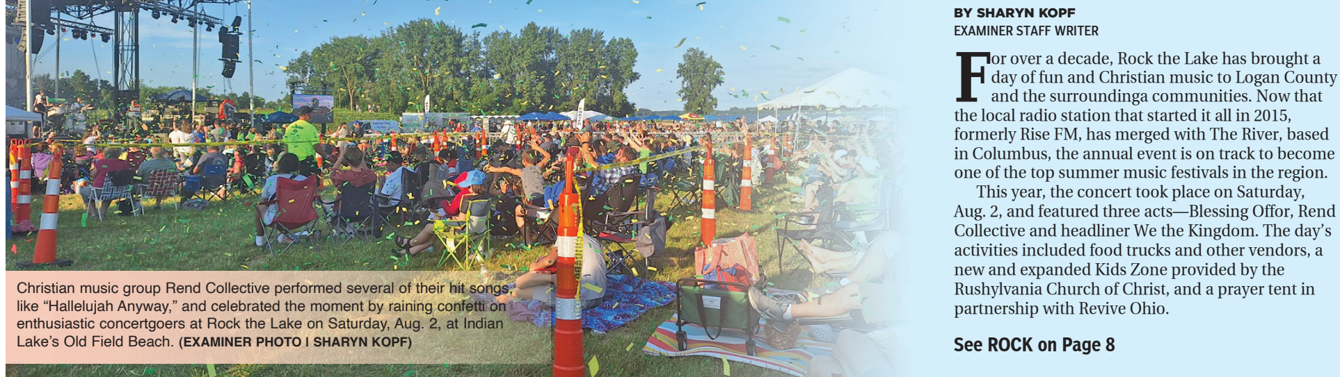
Christian music group Rend Collective performed several of their hit songs, like "Hallelujah Anyway," and celebrated the moment by raining confetti on enthusiastic concertgoers at Rock the Lake on Saturday, Aug. 2, at Indian Lake's Old Field Beach.