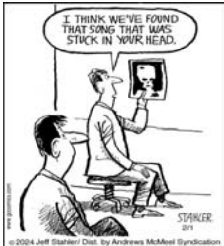
MODERATELY CONFUSED Jeff Stahl