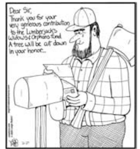
RUBES Leigh Rubin