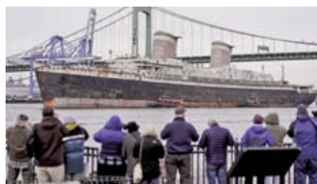
The SS United States is towed down the Delaware River between Pennsylvania and New Jersey, from Philadelphia, Wednesday, Feb. 19, 2025.

The SS United States was once considered a beacon of American engineering, doubling as a military vessel that could carry thousands of troops. Its maiden voyage broke the transatlantic speed record in both directions when it reached an average speed of 36 knots, or just over 41 mph (66 kph). The Associated Press reported from aboard the ship. The ship crossed the Atlantic Ocean in three days, 10 hours and 40 minutes, besting the RMS Queen Mary's time by 10 hours. To this day, the SS