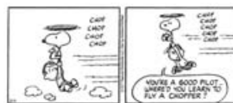
PEANUTS Charles Schulz