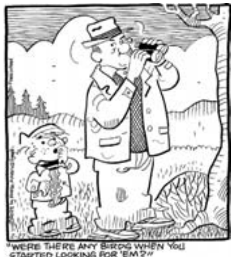
DENNIS THE MENACE Hank Ketcham