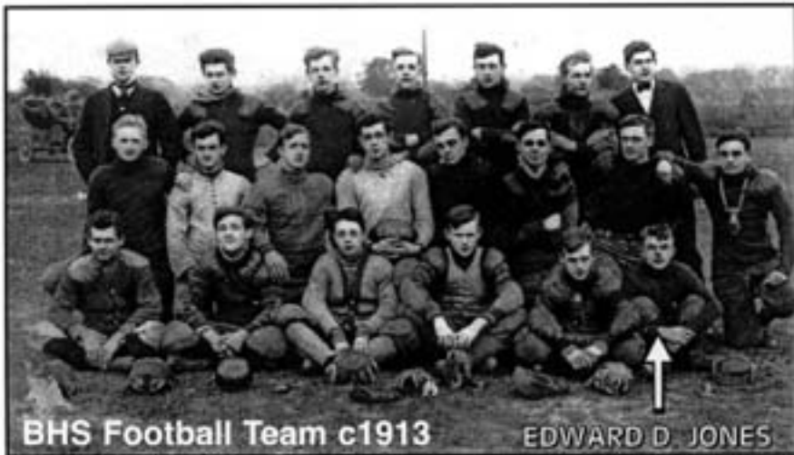
BHS Football Team c1913