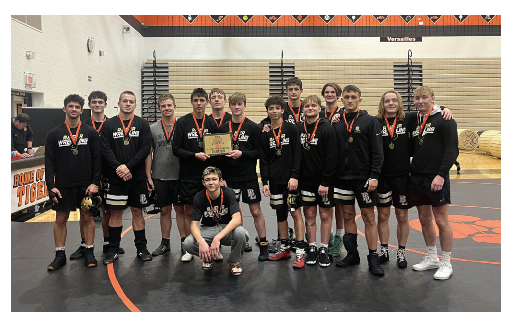
The Benjamin Logan boys wrestlers took first place at the Versailles Duals tournament on Saturday. (SUBMITTED PHOTO)