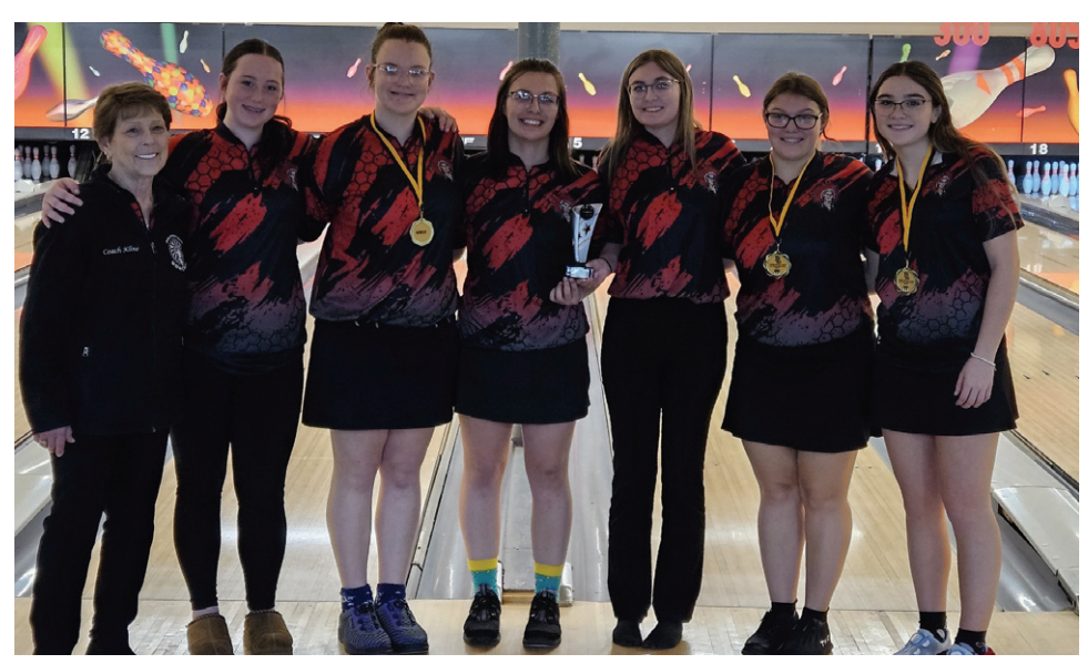
Members of the Bellefontaine girls varsity bowling team pose after taking first place at the Holiday Classic tournament on Saturday at T-P Lanes.