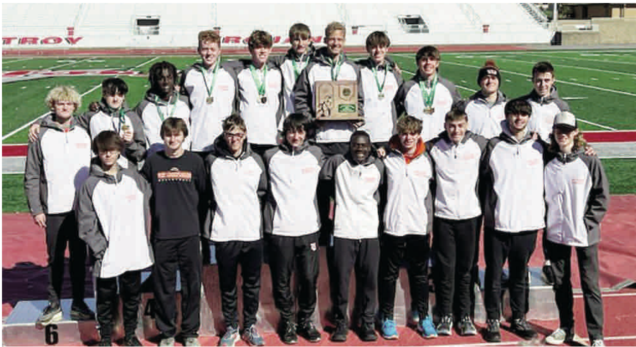
The West Liberty-Salem cross country teams pose on the podium after Saturday's regional meet in Troy. The boys team won the Division II title and the girls squad finished third in Division III.

runners in the field. "Winning is never easy, especially at the Division II level, so to take home the