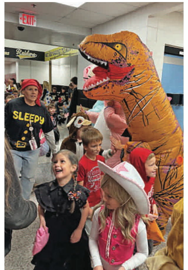
Dinosaurs, cowgirls and many other costumed characters participate in Benjamin Logan's annual Spirit Walk, which brought together more than 600 elementary students and high schoolers.