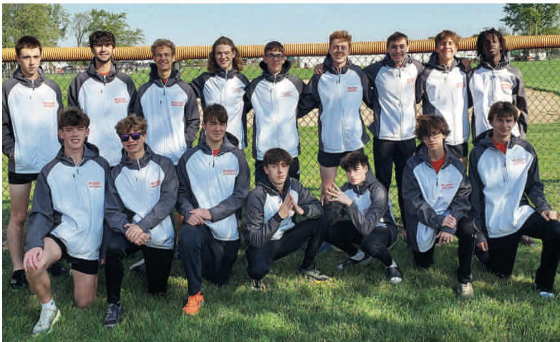
West Liberty-Salem's boys cross country team finished first at the Coldwater Invitational on Saturday.