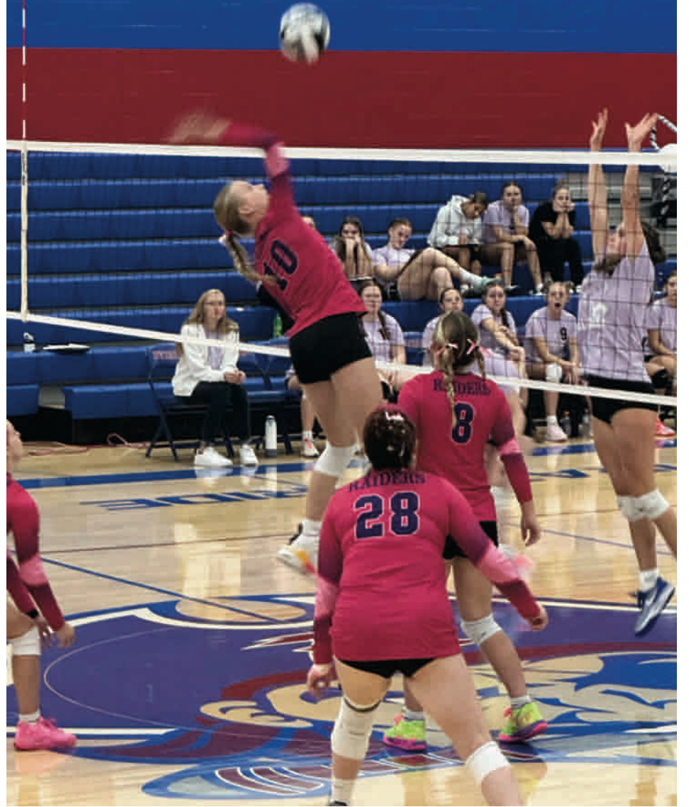
Riverside and Benjamin Logan played in a Volley for a Cure match Saturday.

Calvary finishes the regular season with a record of 6-11.