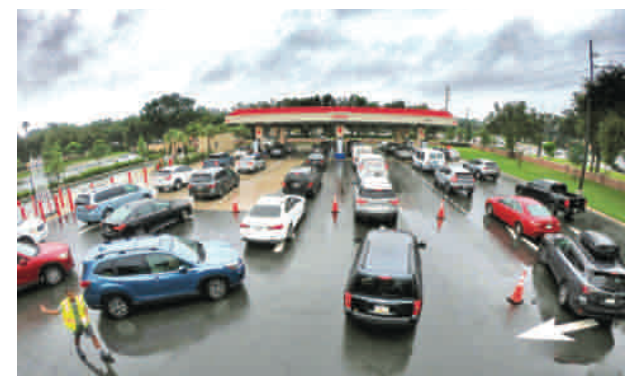
Cars wait in line to get into the parking lot for gas at Costco, Monday, Oct. 7, 2024, in Altamonte Springs, Fla., as residents prepare for the impact of approaching Hurricane Milton.